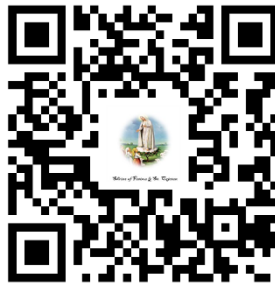
Shrine of Fatima & St. Cajetan Needs of Church Fundraiser https://ppay.co/CiQMI_nWcUc

You can also scan the barcode to donate. →